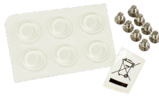
Screw and feet kit (K10)