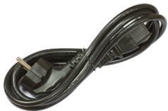
2 IEC cords